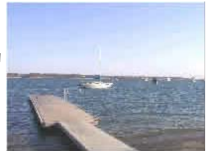
Camanche Lake, California

I believe that I stated to you during one of our evening conversations that I would be happy to support, in so far as possible, the integration of broad scale sailing into my school program. I also believe that I made some statement about how I also had a business to run, limiting my availability of waking hours to devote to such a program. Based on the past two weeks, I have equated volunteerism to, if my memory serves me correctly, Boyles Law which states that a gas fills the void into which is placed with pressure increasing as a function of the energy expended in its placement!