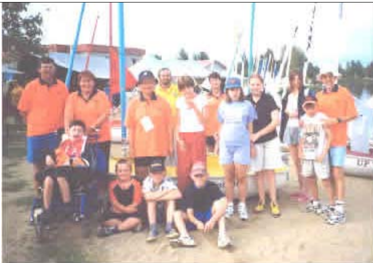
Anson St School Sailing Team & supporters at the 2002 Australian Access Dinghy C'ships

Carcoar Dam Sailing Club have given us lots of support, so we are working with them to improve facilities and access from the road. It is so heart warming to see people working together for a worthy cause. Sailability Orange is community based, for the community, run by dedicated volunteers - it cannot be owned or bought, wouldn't it be nice to see that reflected in the business world!